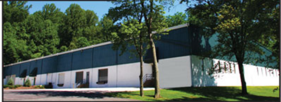
3103 Phoenixville Pike